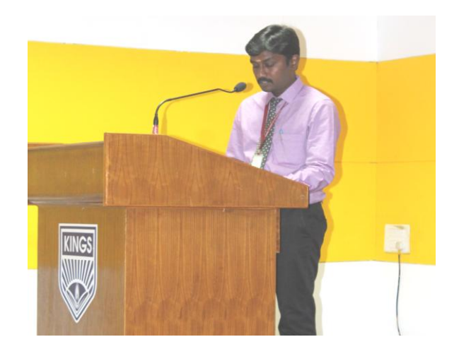
Introduction of Chief Guest