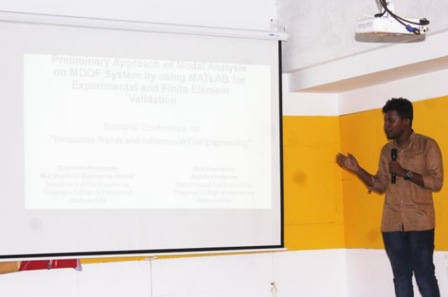
Technical Session - Student Presentation